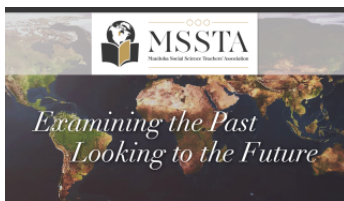
The Manitoba Social Science Teachers' Association